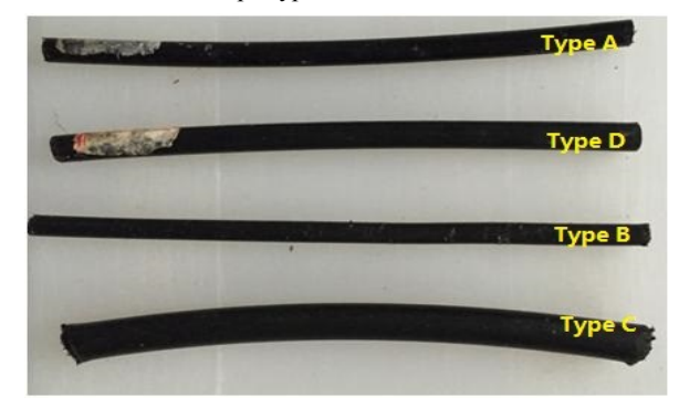
Figure4. The record of group 10 on week 3

4.3 At the end of the experiment on week 3, as the figure 4 shows, the rats of group 10 still achieved the most serious damage compared to all the 5 groups of C57 small rats. There is no obvious bite mark except Type B.