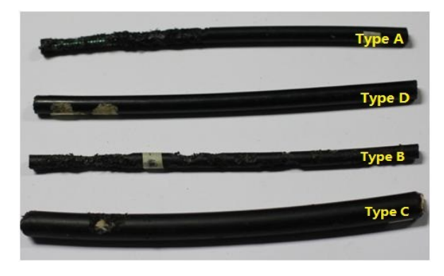
Figure3. The record of group 5 on week 1.

4.2 Week 1, as the figure 3 shows that the rats of group 5 achieved the most serious damage compared to all the 5 groups of SD big rats, and the Type A got severely destroyed as the steel tape armored can be easily found, Type B is also got extensively damaged as the part of steel tape armored can be seen, part of Type C got damaged to see the glass fiber yarn and Type D just got some bite marks.