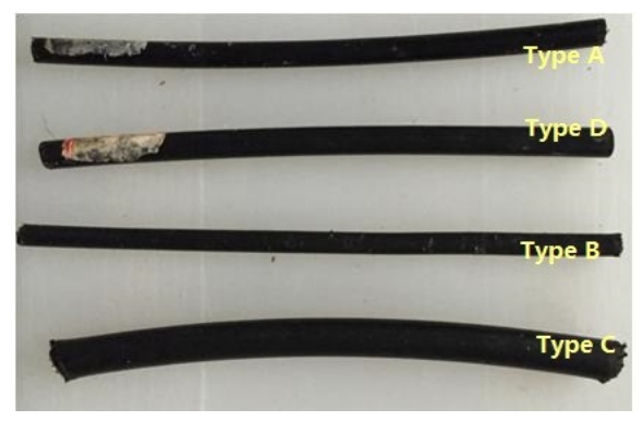
Figure2. The record of group 10 on week 1.

4.1 Week 1, as the figure 2 shows, the rats of group 10 achieved the most serious damage compared to all the 5 groups of C57 small rats.