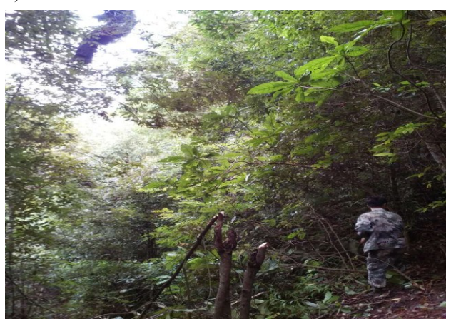
Figure7. The vegetation in Puer

In Puer, Yunnan province, there are mostly mountains and forests (as the figure 7 shows), and lots of rodent animals like squirrel and rat live in there, as a result, the aerial cables got seriously damaged in this kind of environment. Especially from April to August, when squirrel and rat become active, the cables even got damaged within one week after construction , some loose-tube also got broken, the 2km cable got destroyed four or five times within one week in some areas, then lead to line broken, large decay after re-welding and communication interrupt ( shown as figure 8 and 9).