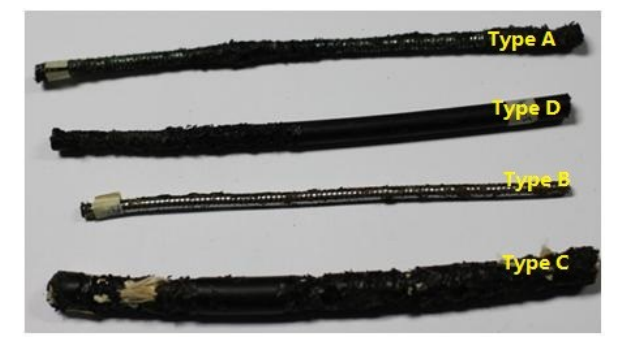
Figure 5. The record of group 3 on week 3

We can see from figure 5 that group 3 Type A got extensively destroyed as the steel tape armored can be easily found, the sheath of Type B is completely damaged as the steel tape armored got totally exposed, part of Type C got damaged to see the glass fiber yarn and just part points of Type D got some destroy.