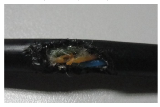
Figure9. Destroyed ordinary aerial cable

Later in these serious rodent areas, aerial cables were replaced by Nylon jacketed Anti-rodent cable GYTS04, about 200 km, which was mainly used in Puer, Jinggu. Ninger, Mojiang and Tonggua for local network and access network project. Table 6 is the actual operational data.