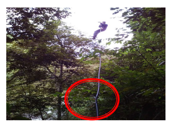
Figure8. Destroyed ordinary aerial cable