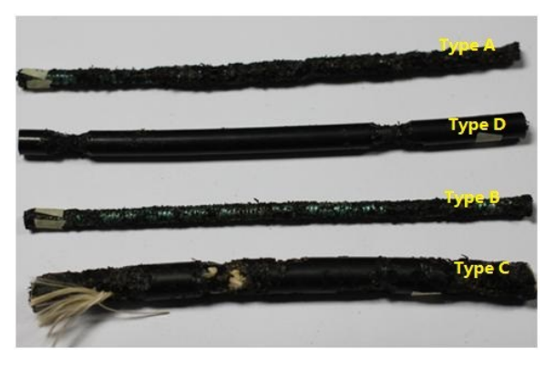
Figure6. The record of group 5 on week 3